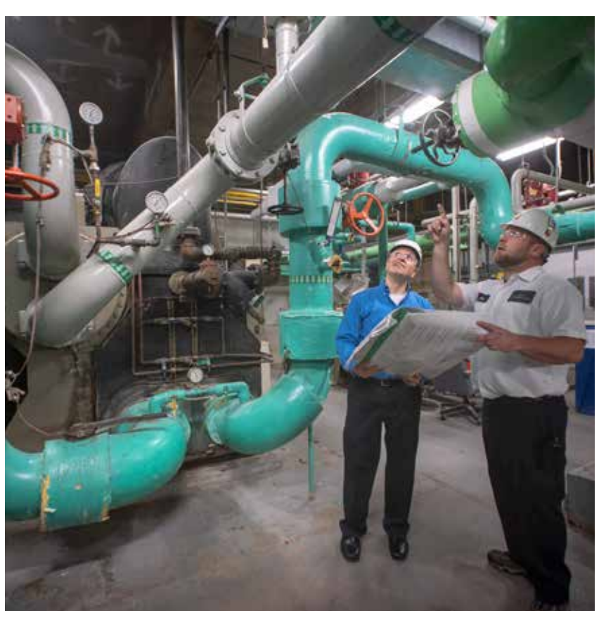
Before the building's new chiller can be installed, the old boilers and chillers have to be moved out from the building's subbasement.

replaced. Everything will be tied in with the new Building Automation System."